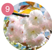
Fugenjou 普賢象 Early Apr. to middle of Apr.