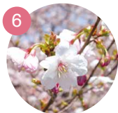
Somei-yoshino 染井吉野 Late Mar.