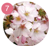
Gotenba-zakura 御殿場桜 Early Apr.