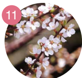
Yama-zakura 山桜 Early Apr. to middle of Apr.