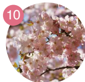
Mikurumagaeshi 御車返し Early Apr. to middle of Apr.