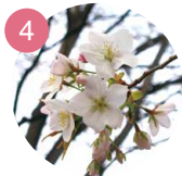
Ohshima-zakura 大島桜 Middle of Mar. to late Mar.