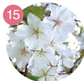
Kasumi-zakura 霞桜 Middle of Apr. to late Apr.