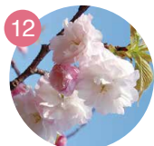
Shujukaku 朱雀 Middle of Apr.