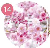
Yaebeni-shidare 八重紅枝垂 Middle of Apr.