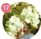
Gyoikou 御衣黄 Late Apr.