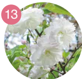
Shougetsu 松月 Middle of Apr.