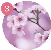
Kohigan 小彼岸 Middle of Mar.