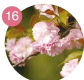
Kanzan 関山 Late Apr.