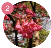
Kanhi-zakura 寒緋桜 Middle of Mar.