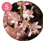
Shidare-zakura 枝垂桜 Late Mar.