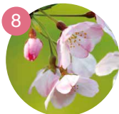
Jindaiakebono 神代曙 Early Apr.